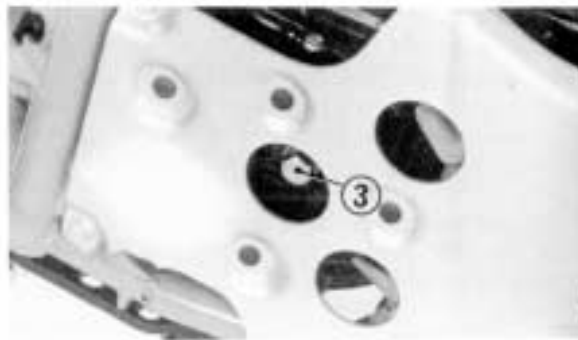
(3) Oil drain bolt