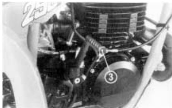
(3) Kick starter