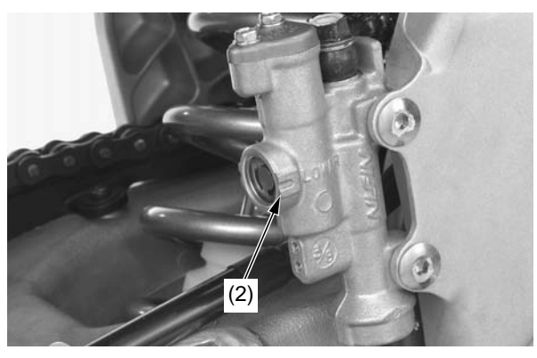
(2) LOWER level mark

With the motorcycle in an upright position, check the fluid level.