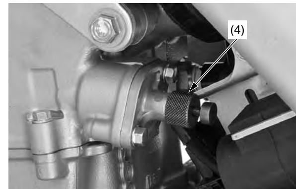
(4) tensioner stopper