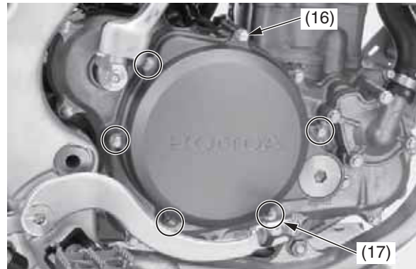
(16) clutch cover bolt A (17) clutch cover bolts B