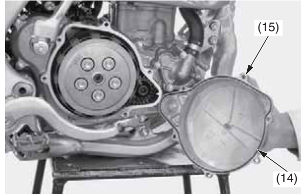
(14) O-ring (new) (15) clutch cover