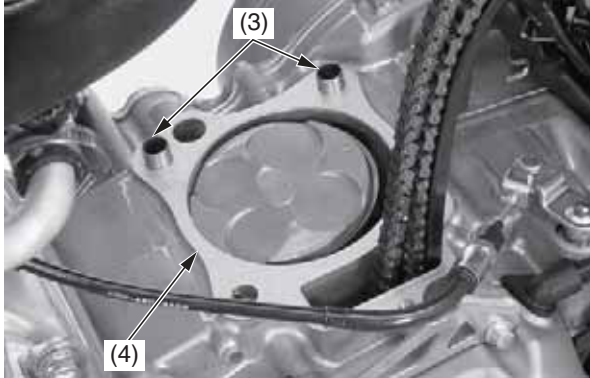
(3) dowel pins

Do not let the dowel pins fall into the crankcase.