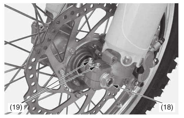
(18) front axle nut(19) left axle pinch bolts

14. Install the handlebar (20), mounting rubbers, washers and handlebar lower holder nuts (21) and tighten the handlebar holder nuts to the specified torque: 32 lbf.ft (44 N·m. 4.5 kgf·m)