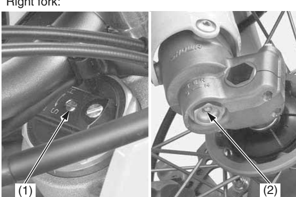
(1) compression damping adjuster (2) rebound damping adjuster