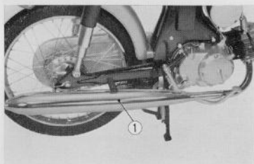
Fig. 4.64 S90