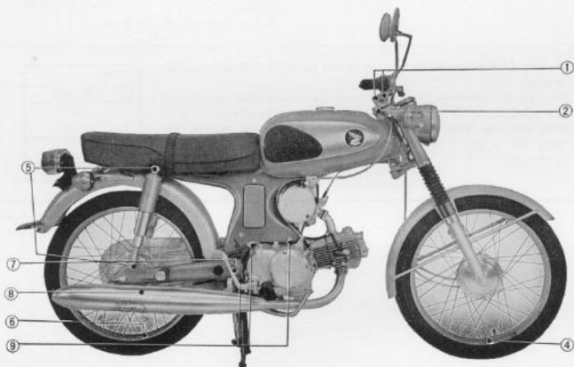
Fig. 5.40 Torquing points on right side